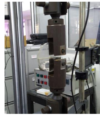
Interface Crack Studies